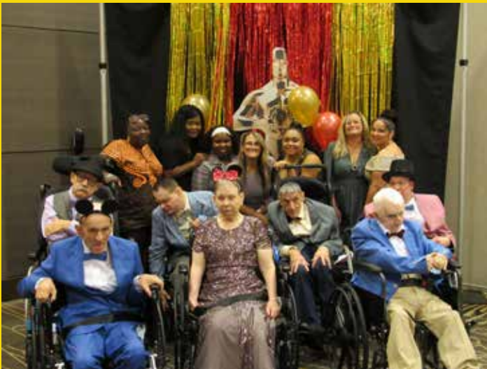
The star-studded procession from Sinking Spring stroll onto the red carpet in grand style.