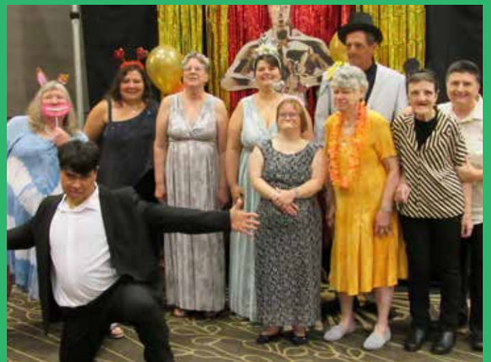
Friends of Family Support Services and Life Sharing show everyone what it means to party.