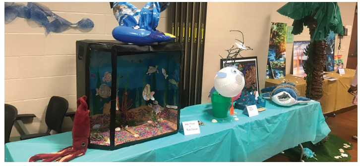
Above: The Event Room at Kutztown Road was turned into a nautical paradise.

This year's Art Show went "swimmingly," and we cannot wait to see what next year's show theme will be.