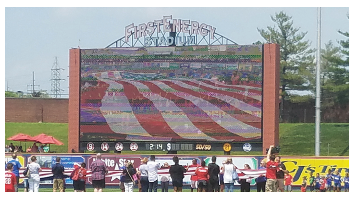
Program participants, employees, board members, and supporters unfurl the American flag before the game begins as the fans sing the National Anthem.

On Sunday, May 19, we celebrated Prospectus Berco Day at the Reading Fightin Phils. Thanks to our sponsor, Boscov's Travel, we handed out more than 400 tickets to program participants, families, employees, and supporters to attend the afternoon game.