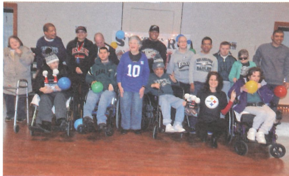
Program participants in the Adult Training Program ban together in support of the Philadelphia Eagles in the Super Bowl. But wait a minute! Do you detect a couple of Eagles traitors?