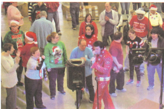
After performing for the Adult Training Classrooms in the morning, Elvis put on another performance for the Vocational Program, and they were taking in every moment.