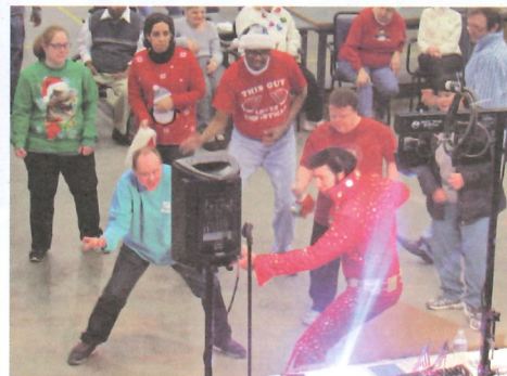
The Vocational Production Workers can play the air guitar along with the best of them!