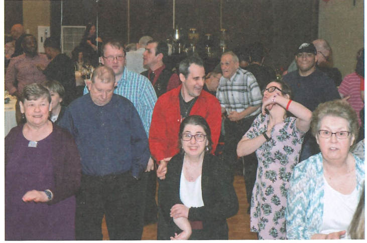
No awards dinner at Prospectus Berco is complete without everyone on the dance floor. We do love our dancing!

Bright Lights! Adoring Fans! Instant Recognition! The life of a rock star would be exciting and exhilarating. We all want to be admired and recognized for our talents and contributions to our community. And that's what happened on Sunday, March 31, at the DoubleTree by Hilton Hotel in Reading when the 27th Annual Awards Dinner was held.