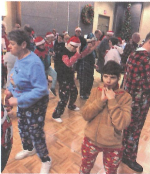
A Holiday Pajama Party was held on December 22, 2018, at the DoubleTree Hotel. Now why didn't we think of this before???