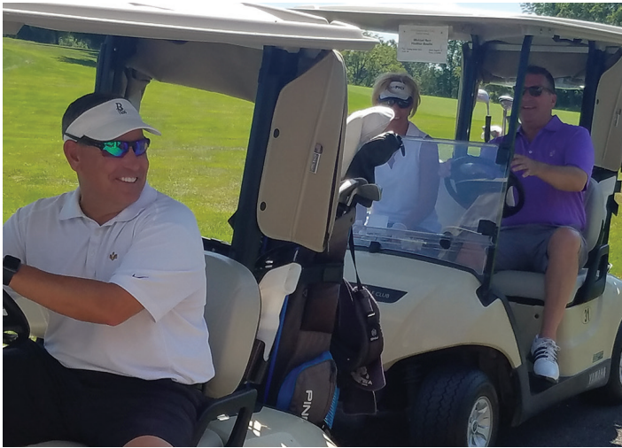
All the golfers navigate toward the Snack Stand to enjoy some cool drinks and tasty snacks.