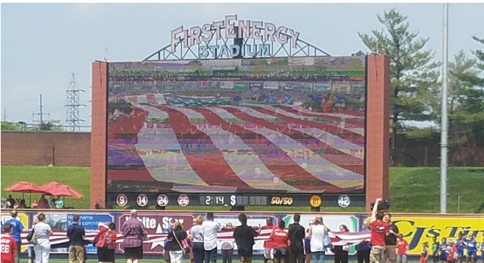
Program participants, employees, board members, and supporters unfurl the American flag before the game begins as the fans sing the National Anthem.

On Sunday, May 19, we celebrated Prospectus Berco Day at the Reading Fightin Phils. Thanks to our sponsor, Boscov's Travel, we handed out more than 400 tickets to program participants, families, employees, and supporters to attend the afternoon game.