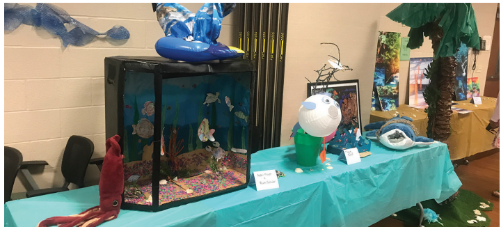
Above: The Event Room at Kutztown Road was turned into a nautical paradise.