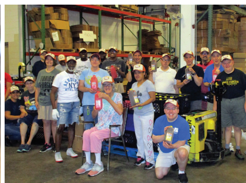
Hats Off (or On!) to Clover Farms Dairy who donated hats to the Vocational Production Workers in appreciation of the work which they do in the packaging of Clover Farms Dairy products.