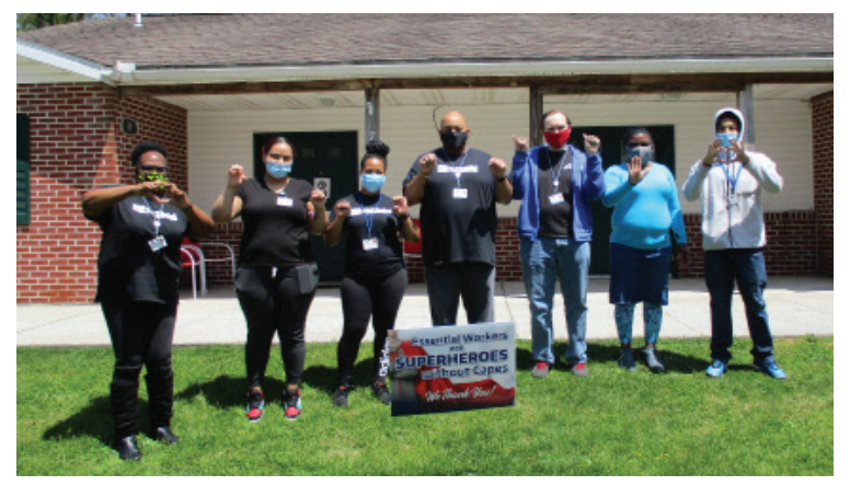
Prospectus Berco is full of "heroes without capes." Residential employees got together to take a photo for a video message thanking employees for all that they do. They even shared some of their sign language skills, #essential.