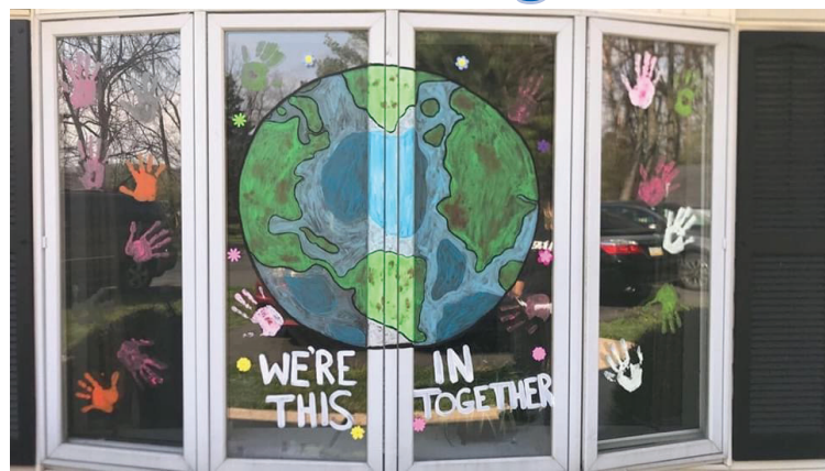
We had so many beautiful window displays during Spirit Week. Residential participants and staff worked together to create inspiring messages, which were shared on social media as well.